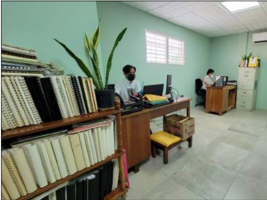
Rehabilitation Resource Center, Belize City

In 2021, a total of 42 newly blind and 4 new low vision patients were referred to the Rehabilitation Programme from the Secondary Eye Care Programme. The majority of patients were diagnosed with irreversible blindness due to Glaucoma and Diabetic Retinopathy.