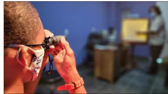
Student, diagnosed with low vision, is fitted with a telescope to improve his sight

Low Vision clinics resumed with Optometrist Freddy Nicholson and the turnout has been wonderful. While we are able to dispense glasses and magnifiers to improve the vision for some patients.