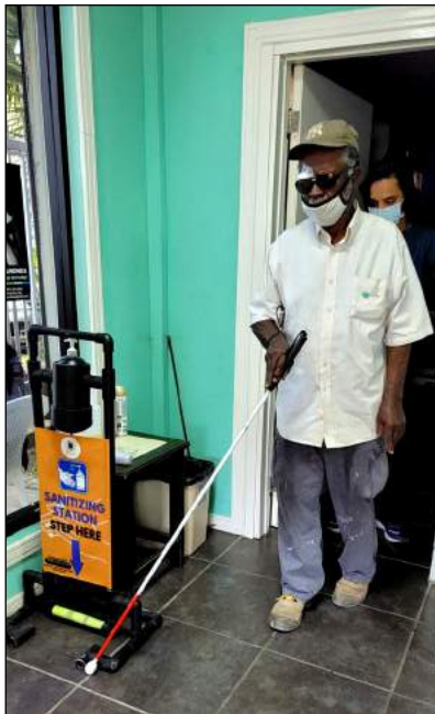
A client, newly diagnosed as blind, receives a cane

The Ministry of Health and Wellness has allocated a space for BCVI in their new Outpatient and Rehabilitation Center in Belmopan which will allow us to resume full-time clinics in the Cayo District for the first time since 2020.